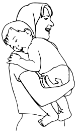
Shoulder Carry Position

There must be “50 ways to hold your baby”, but some of the safe positions are: